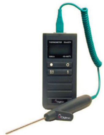
3208 IS Model

For other options, please contact us sales@digitron-italia.it or +39 (0)775 392052