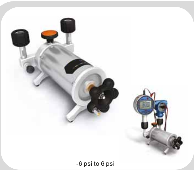
-6 psi to 6 psi