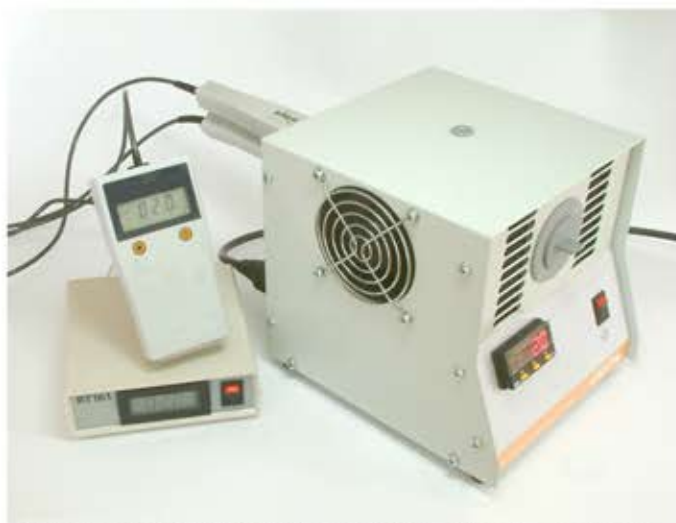
CS174 with RT162 & PC Temp PT2 portable thermometers

A simple to use, cost effective system for on site/laboratory calibration of both contact and non-contact (infrared) thermometers, to adhere to quality standards such as ISO9000 and HACCP.